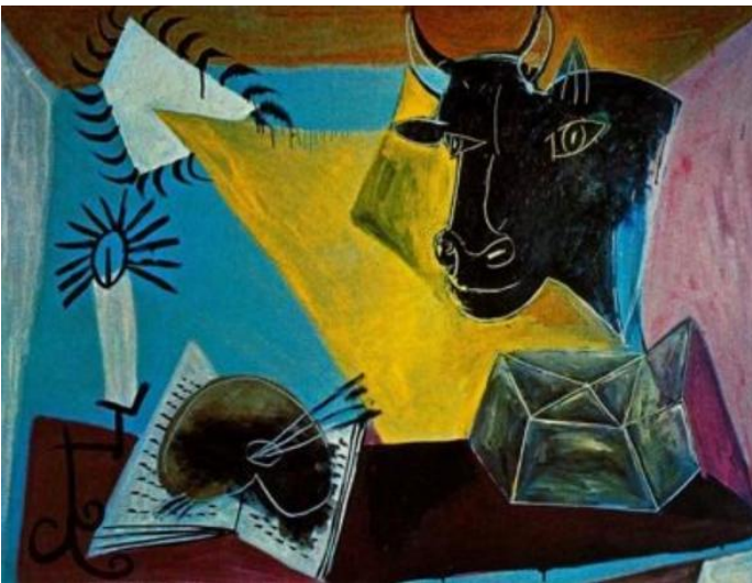
Still Life with Candle Palette and Black Bull's Head by Pablo Picasso

-Other abstract forms and lines are also visible in the background.