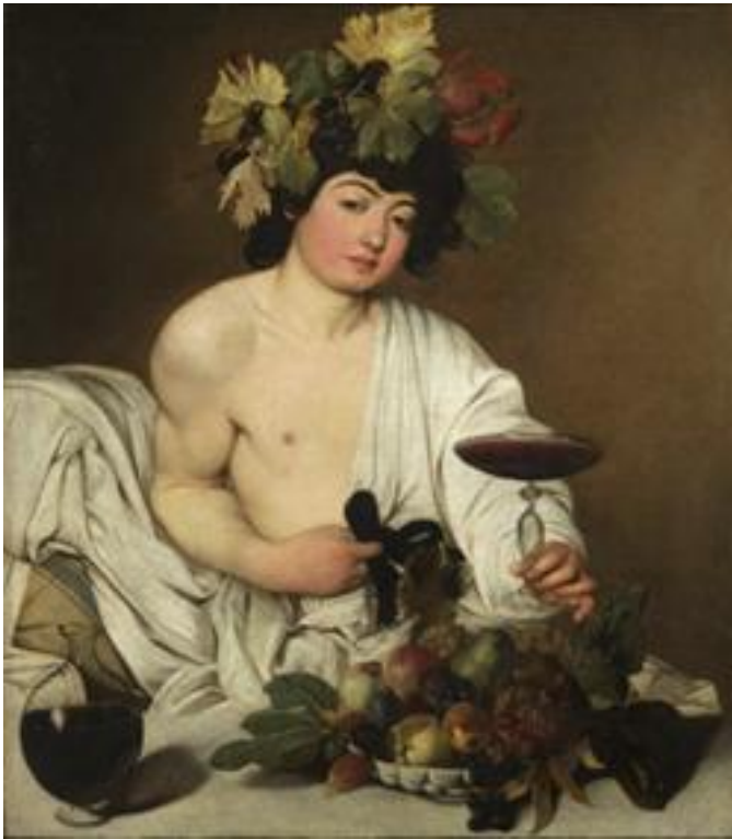
Bacchus by Caravaggio

→ Bacchus by Caravaggio and Thanatos by Jacek Malczewski → correct identification of the gender by GPT-4o.