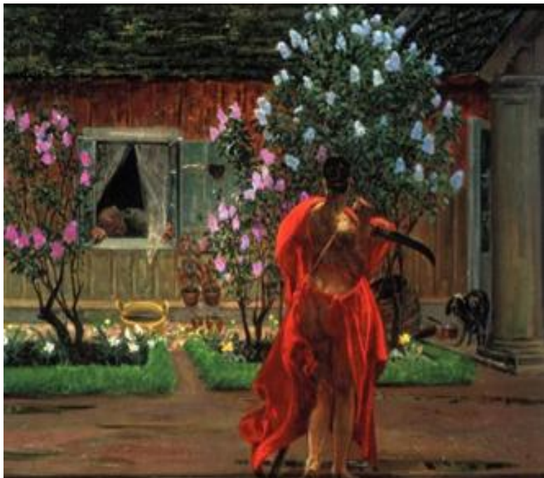
Thanatos by Jacek Malczewski