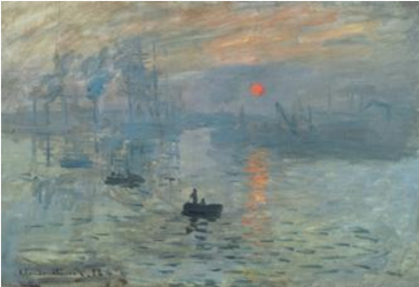
Impression, Sunrise by Claude Monet