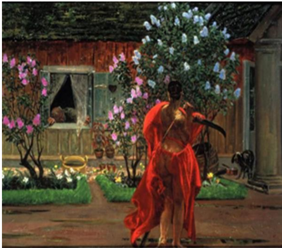
Thanatos by Jacek Malczewski