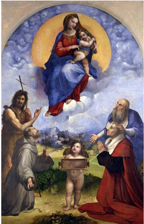
Madonna di Foligno by Rafael Santi

The painting depicts a religious scene with the Virgin Mary and the Infant Jesus in the centre. The Virgin Mary is seated on a cloud, dressed in a blue robe and red gown, holding the Infant Jesus on her lap. Above their heads is a halo. Below, on the ground, are five characters. On the left stands St John the Baptist with a cross in his hand, next to him kneels St Francis of Assisi , who holds a cross in his hands. On the right kneels St Jerome wearing a red cloak, and next to him stands St Augustine with a beard, dressed in bishop's robes. In the middle, between the saints, stands the Little Angel who holds a plaque in his hands. The background of the painting is picturesque, with clouds and sky visible. The entire scene is surrounded by an arched border.