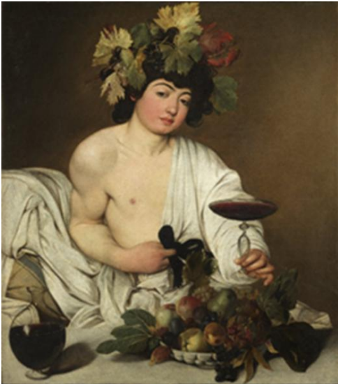
Bacchus by Caravaggio