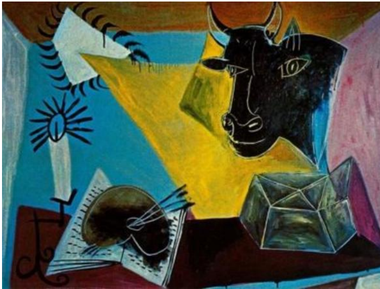
Still Life with Candle Palette and Black Bull's Head by Pablo Picasso