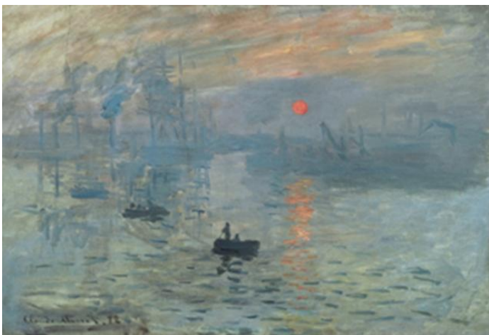
Impression, Sunrise by Claude Monet