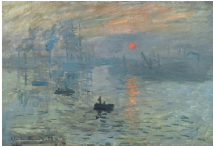
Impression, Sunrise by Claude Monet

The painting depicts a harbour scene at sunrise, painted in the Impressionist style. In the foreground, one can see the water with several small boats, on one of which there is a character. In the background, one can see the outlines of ships and masts, as well as harbour cranes. The sky is covered by delicate clouds, and the sun, which is orange, is reflected in the water, creating a luminous path. The colours of the painting are muted, dominated by tones of blue and gray, with accents of orange from the sun. The painting is known as "Impression, Sunrise" by Claude Monet.