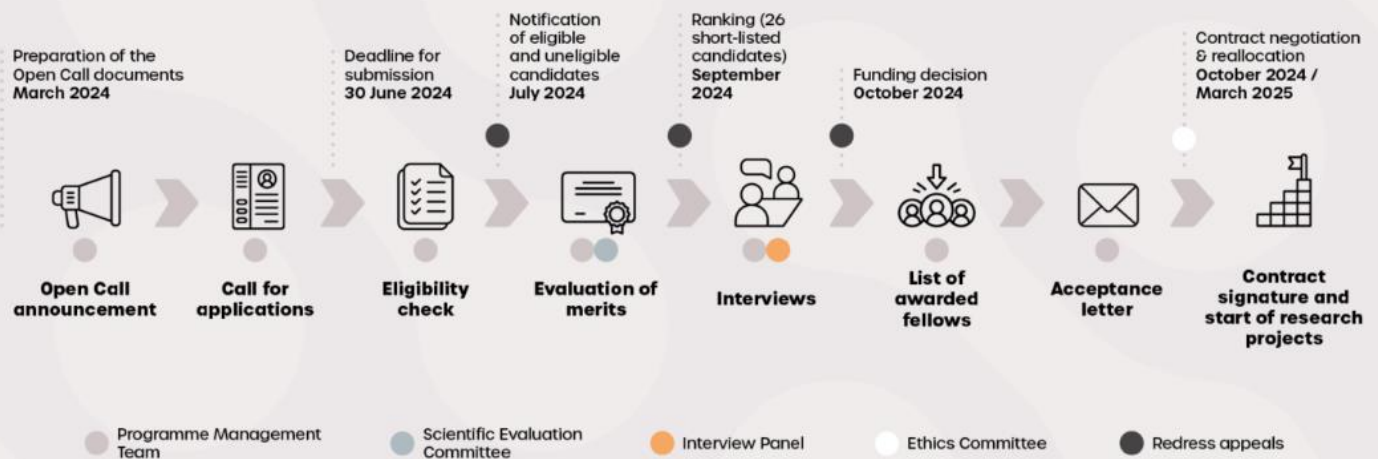
Figure 3: TOUCH selection workflow.