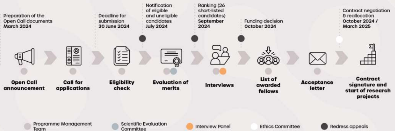
Figure 2: TOUCH selection workflow.

Phase IV (Final scoring and ranking): The PMT will proceed to prepare the final ranking using evaluations and scorings from Phases II (50% scoring weight) and III (50% scoring weight). A Consensus Report will be prepared by collaboration and agreement of the evaluation committees with the final decision. As in Phase II, an Evaluation Summary Report will be prepared and sent to those fellows not selected for funding, including if they are part of the reserve list and their position in the ranking. After the final ranking list is produced, those fellows ranked "recommended for funding" will be asked to sign an acceptance letter within a period of 15 days to secure their fellowship . A reserve list will be established in case one of the selected candidates rejects the offer. Once the acceptance letters are received by the PMT, the awarded fellows will be contacted by the PM via email with an invitation to start negotiating the terms of the contract and associated procedures with the hosting organisation to enrol them in the PhD doctoral studies. In this email the contact details of the person in charge at the hosting institution and the future PhD supervisor will be included.