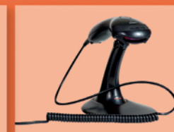
Bar code reader